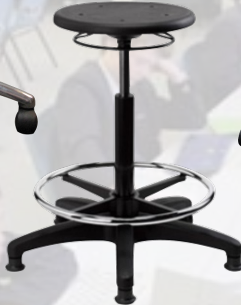
Eclipse Curie Stool