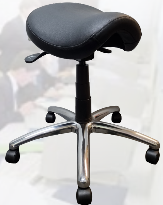
Eclipse Saddle Stool