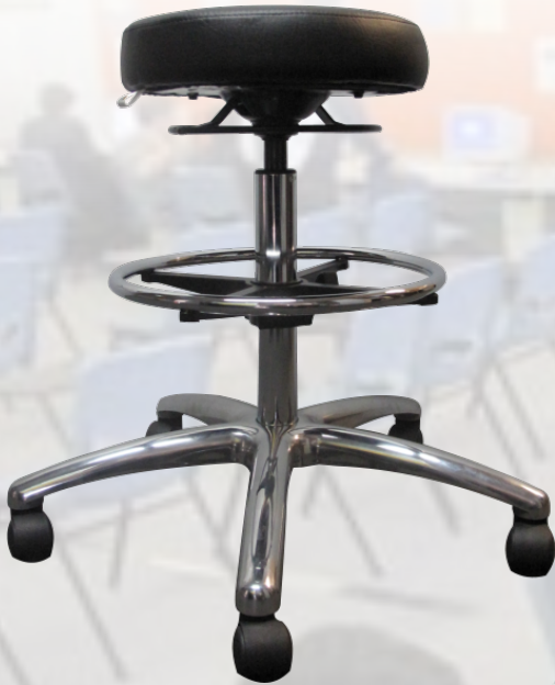
Eclipse Cutter Stool