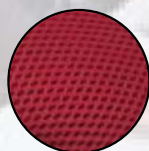
Ruby Mesh Fabric