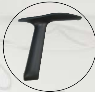
• Optional Arms