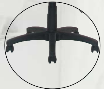
• Five Star Castor Base