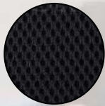
Ebony Mesh Fabric