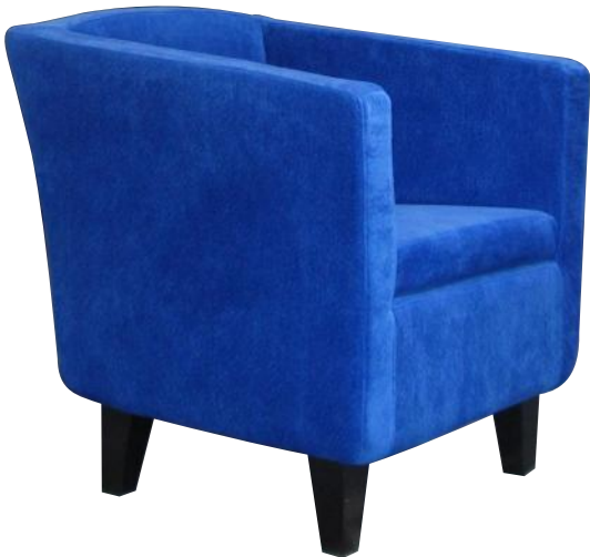
CLASSIC TUB CHAIR